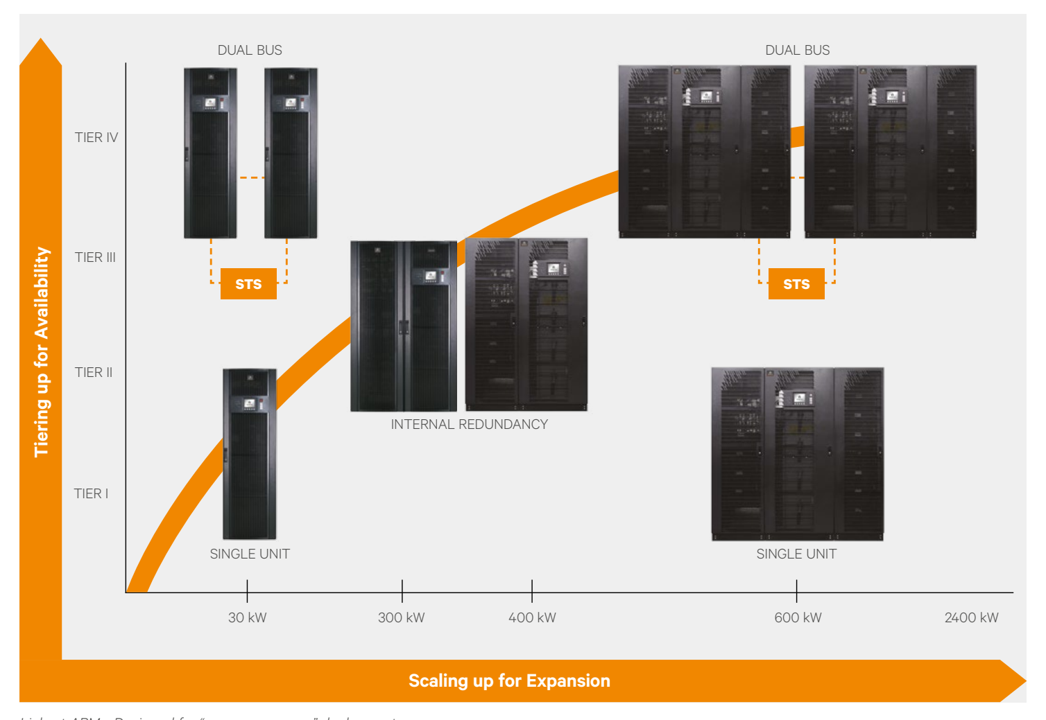
Liebert APM - Designed for "pay-as-you-grow" deployment

Additionally, Liebert APM allows easy deployment of Tier 4 architecture through its integrated dual bus control.