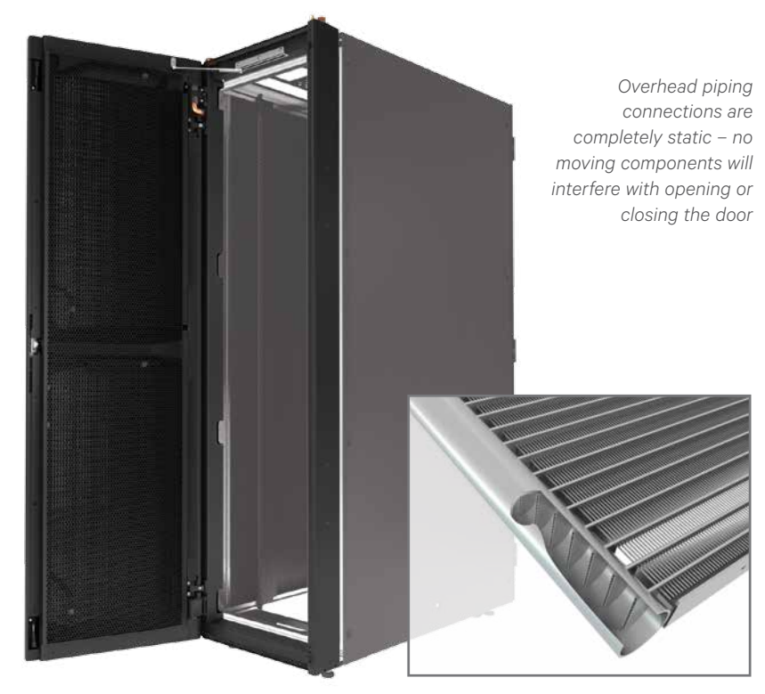
Liebert XDR Rack Door Cooling Module

The Liebert XDR is a part of the Liebert XD high heat-density cooling system that utilizes pumped refrigerant technology. The pumped refrigerant operates at low pressure in the system and becomes a gas at room conditions, making it ideal for use around electronic equipment. Since the Liebert XDR always provides 100% sensible capacity, the need for computer room air conditioners to provide humidification is significantly reduced, resulting in lower energy usage.